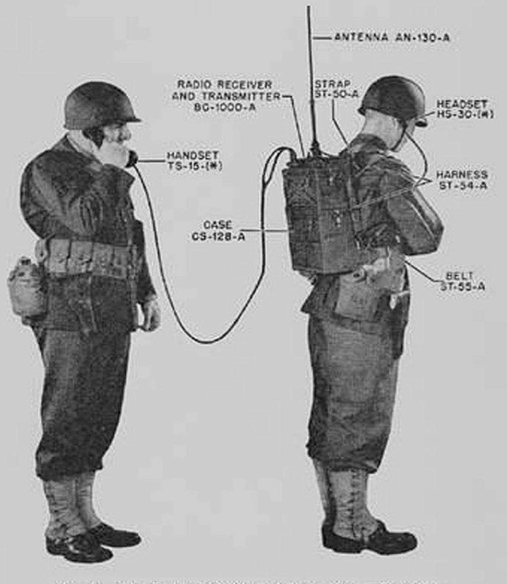
Figure 1. Radio Set SCR-300-A. In Use, Viewed From Right Side,